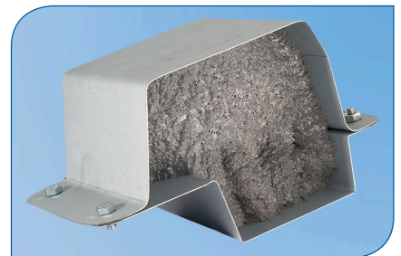
L&L Seal heat expanded baffle system.