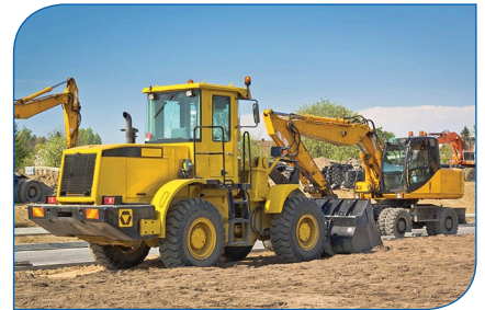
Lighter, stronger, quieter and safer.

L&L's structural reinforcement technologies can strengthen, stiffen and improve crash and acoustic performance in all types of construction vehicles and equipment. L&L Reinforce solutions can enable down gauging or reduced substrate wall thickness without loss of structural integrity in aluminum and steel body structures.