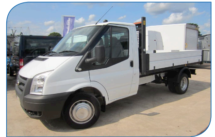
Stronger, quieter and safer light trucks.

L&L's structural reinforcement technologies can strengthen, stiffen and improve crash and acoustic performance in all types of light trucks. L&L Reinforce solutions can enable down gauging or reduced substrate wall thickness without loss of structural integrity in aluminum and steel body structures.