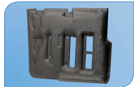
DECI-TEX molded insulation panel.