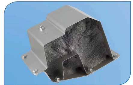
L&L Seal heat expanded baffle system.